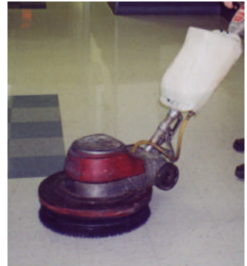
The cost-effective, environmentally conscience scrub brush in use on a side-by-side scrubber.

The brush advantage has been threefold: The initial cost of the brush in January has already paid for itself; storage space, always at a premium, is restored for other uses; and most importantly, the need to discard of chemical-laden pads is drastically reduced.