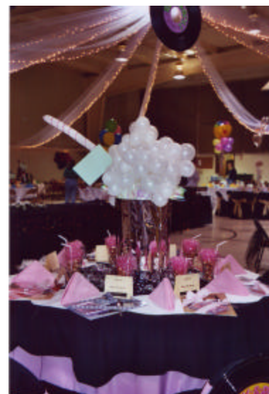
Scioto Corporation's 50's style table was awarded the prize for "Most Creative."