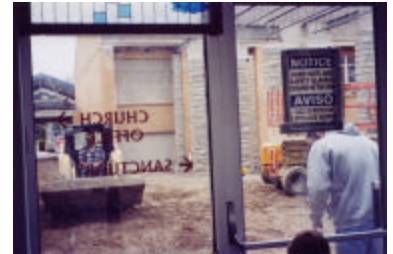
The renovation project includes an addition to the education building, renovation of the fellowship hall, and a new storage area.

With over 500 people attending services and activities each weekend, Scioto Valley Supply stands ready to assist with the care of new surface floors and carpets, as well as additional supply needs. Customer Service Representative Amanda Sutherin is eager to help. “They have always been a great customer with which to work. We are looking forward to being available to accommodate their needs as they grow.”