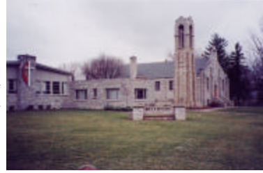
Riverside United Methodist Church is located at 2701 Zollinger Road, Upper Arlington, Ohio.