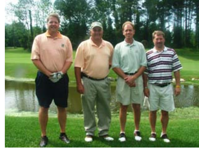
Golfing for a Cause: