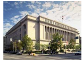
Welcoming a New Standard of Cleaning: The Hamilton County Courthouse (above) and the William Howard Taft Building (below) are located in historic downtown Cincinnati.

Operationally, the Scioto management team has already established a new and effective way of cleaning the structure. With a fresh set of eyes to the situation, the managers created a new process of cleaning the building from inside out, rather than a traditional top to bottom plan to better accommodate the complex layout of the building.