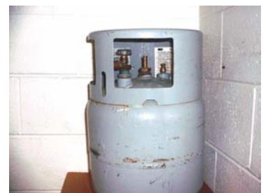
Because propane is a portable emergency source, it can fulfill many industry needs. One of the largest uses of propane at the American Honda Warehouse is for the operation of the riding sweepers and scrubbers.