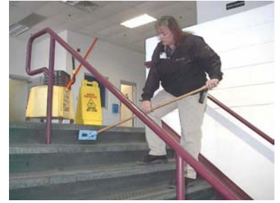
The Flo-Pak swivel scrub brush, shown above to clean the kick plate steps, and below, to clean the corners and edges in the restroom facilities.

The requirements to use the swivel scrub brush are simple: a long handle is needed and appropriate cleansers can be sprayed directly onto the brush. Since the long handle allows the user to stand while scrubbing, it also eliminates back strain and the need for one to get down on hands and knees to perform detailed cleaning tasks.