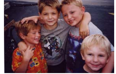
Strangers at the start of the day, Scioto children became fast friends as they found playmates to share in the fun.