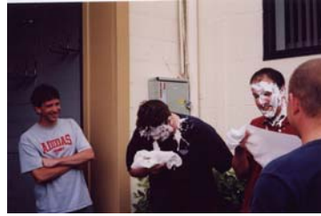
Friends and co-workers stood in line to take their best shot at Scioto managers in the pie throwing contest.