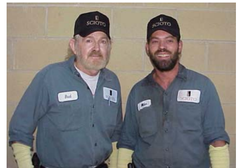
The restructuring of tasks resulted in a significant cost savings to Honda and brought about the next challenge for the Scioto associates in the Weld Department: continued efficiency to ensure Scioto's future role in adding value to Honda's operations.