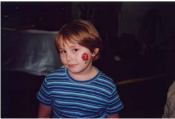
Face painting provided children with a fun way to show their support for the cause of the day.