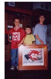
The big ticket item of the day was the much sought-after OSU print that brought over $250.00!

***Terry is a qualifying associate for the catastrophic leave sharing program.***