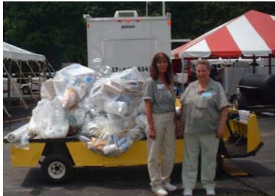
The most important job of the event was staying on top of the trash disposal. A larger food court with more vendors did not keep Scioto associates from leaving no trash can overflowing!