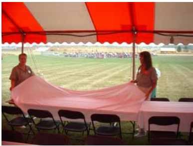
White linen tablecloths were used for the first time to honor the special anniversary. One thousand tablecloths were used daily, stored and returned to bins in a separate tent when replaced.