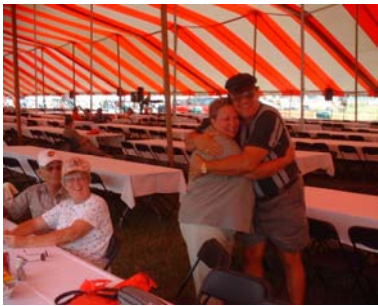
Scioto associates act as friendly ambassadors for Honda, helping to pass out hats, pins and scarves during the event, while making new friends in the process.

Honda Homecoming: A three-day annual event attended by over 15,000 motorcycle enthusiasts worldwide who return to the Marysville area for community events and the opportunity to tour the plant where their prized motorcycles are manufactured.