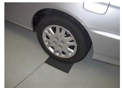
The moveable pieces of rubber, shown close-up above, are placed under each wheel, shown below, to alleviate dark marks appearing on the garage floors.