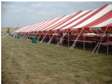
The dining tent, doubled in size from years past, housed 250 tables and sat nearly 2000 people.

While MAP General Cleaning associates served the outside festival area, MAP Motorcycle General Cleaning associates were responsible for keeping up the appearance of the plant. With many visitors touring the plant each day, it took a great deal of coordination on their part to wax the tour route while maneuvering around the constant flow of production traffic.